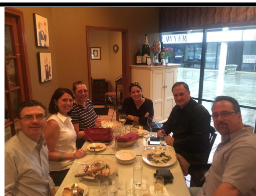
Monthly Happy Hour