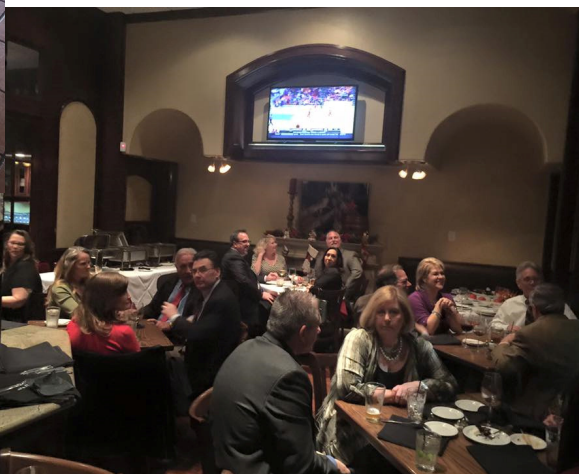
2015 Christmas Party