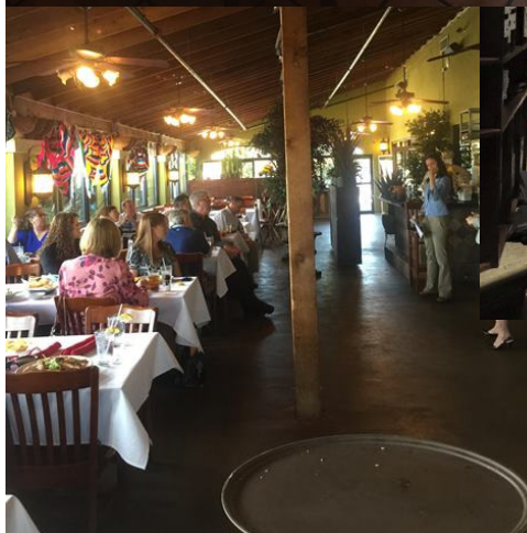
11/16 CLE Lunch