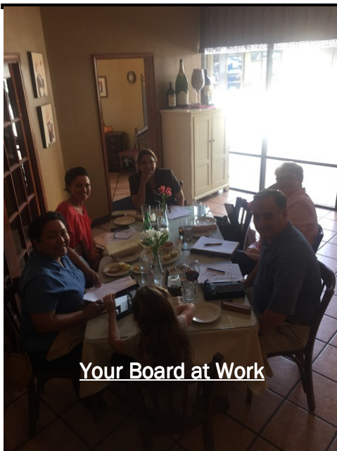
Your Board at Work